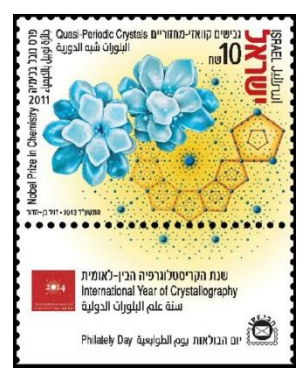
Israel Philatelic Service