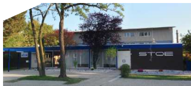
STOE in Darmstadt, Germany

The IUCr, together with STOE, DECTRIS and Xenocs have now announced the selected delegates for the IUCr-UNESCO OpenFactory in Darmstadt and Grenoble. Delegates are young scientists, from PhD students to Assistant Professors and represent nineteen different countries.