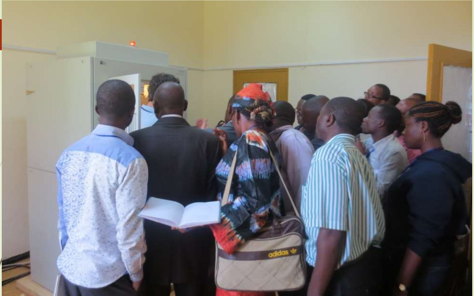
A group of students during practicals on the Siemens D5000 powder diffractometer (International Workshop on Crystallography, 8 – 12 April 2013, Dschang, Cameroon)