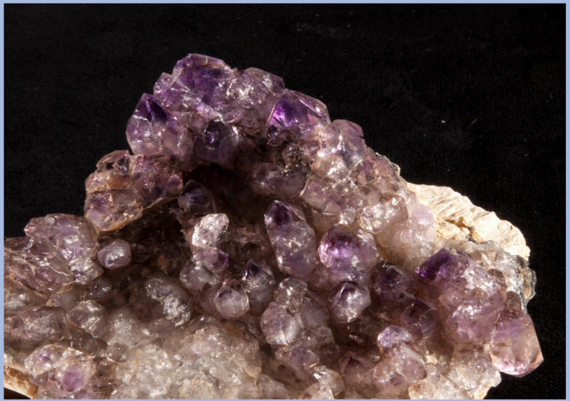
Quartz amethyst, Silver-Star, Montana, USA.