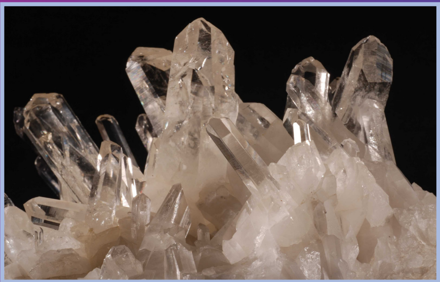
Quartz « rock crystal », La Gardette, Isère, France.

Quartz is one of the major components of the Earth's crust. It can be found in many of our mountain ranges, and particularly in the Alps. It is a colourless, transparent, crystallised silica (SiO 2 ) commonly known as « rock crystal ».