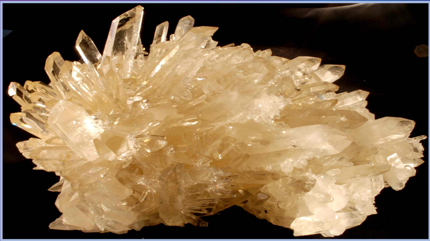
Quartz herisson, Mine de la Gardette, Isère, France.