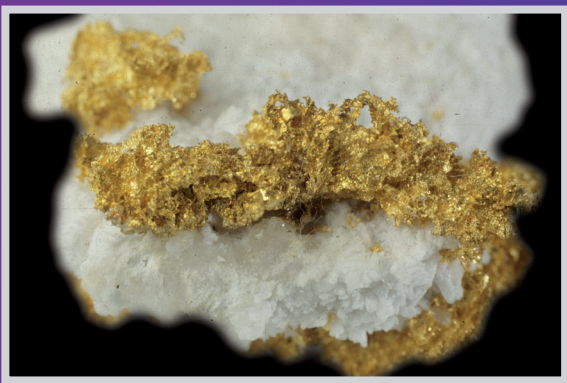
Native gold on quartz, Mine de la Gardette, Isère, France.

In its purest form it is colourless and transparent, and known as « rock crystal ». Impurities are responsible for its coloured forms: violet for amethyst, yellow for citrine.