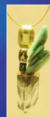
«Jouvence» pendant © Col. Jean Vendome