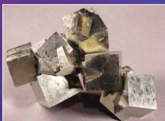
Pyrite or "fools gold"