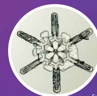
Crystals of freshly fallen snow