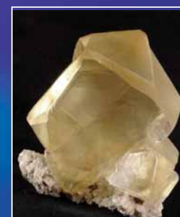
Calcite - Sarbaiski Mine, Kazakhstan