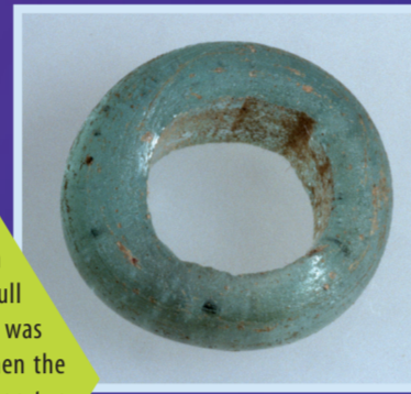
A glass pearl (-100 - 300 BC). Musée de Bretagne - Rennes

Our earliest information (Pliny the Elder) suggests that glass was a Phoenician/Egyptian invention: Egyptian merchants stopping off on the Phoenician coast lit a fire on the beach close to their bags full of natron. Natron contains sodium carbonate and was used by the Egyptians to mummify their dead - when the merchants woke up the next day their bags had been turned into stone. The silica in the sand had mixed with the sodium in the natron to make a form of glass. This early glass - like that of the Romans and Gauls - was opaque. It took several more centuries before transparent glass could be produced.