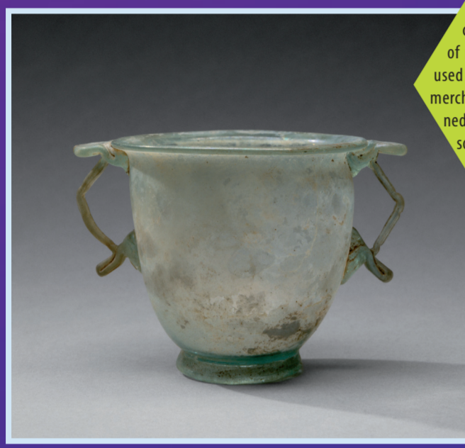
Skyphos (1st century) Pompeii.

Our earliest information (Pliny the Elder) suggests that glass was a Phoenician/Egyptian invention: Egyptian merchants stopping off on the Phoenician coast lit a fire on the beach close to their bags full of natron. Natron contains sodium carbonate and was used by the Egyptians to mummify their dead - when the merchants woke up the next day their bags had been turned into stone. The silica in the sand had mixed with the sodium in the natron to make a form of glass. This early glass - like that of the Romans and Gauls - was opaque. It took several more centuries before transparent glass could be produced.