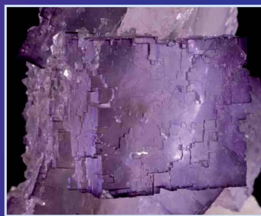
Details of fluorite crystal growth forms.

Are crystals the result of growth in inert matter, or are they sculpted by nature?