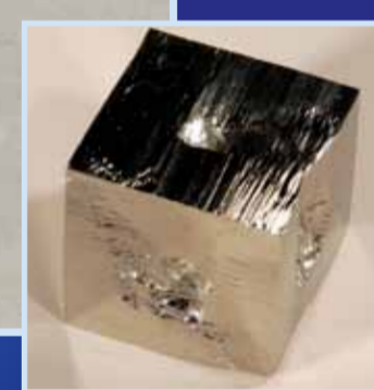
A pyrite crystal, Alcarama, Rioja, Espagne.

Stensen 1669 De solido intra solidum naturaliter contento dissertationis prodromus. Christiaan Huygens 1690 Opera Reliqua.