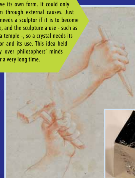
Three hands wielding the sculptor's tools.

For Aristotle, inert matter, of minerals for example, was a material cause, which could not have its own form. It could only take form through external causes. Just as marble needs a sculptor if it is to become a sculpture, and the sculpture a use – such as gracing a temple –, so a crystal needs its sculptor and its use. This idea held sway over philosophers' minds for a very long time.