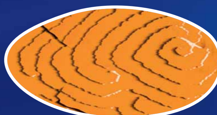
Surface of a biological crystal showing stacking faults as seen by atomic force microscopy .