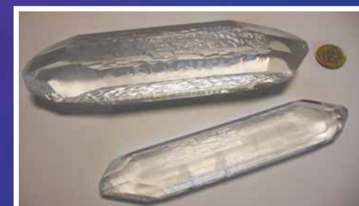
Synthetic quartz crystals.