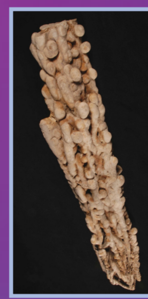
Calcite in a stalactite