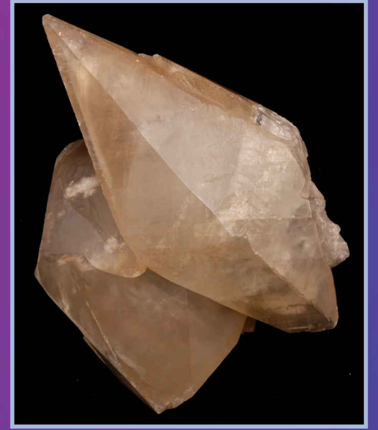
Calcite in scalahedron form

A mineral can have many different crystalline forms. The champion in this regard is calcite or calcium carbonate ( \text{CaCO}_3 ), the main constituent of limestone.