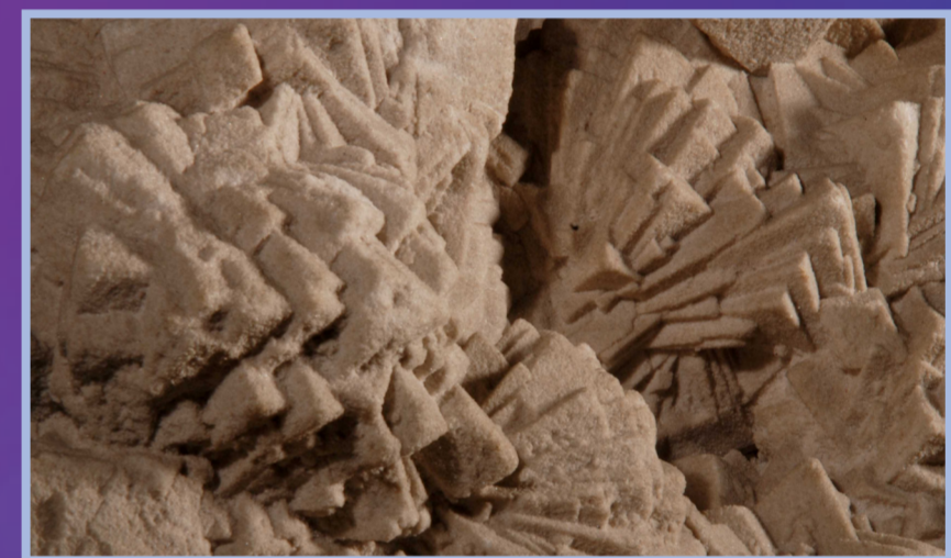
Sandy calcite, Fontainebleau, Seine et Marne, France