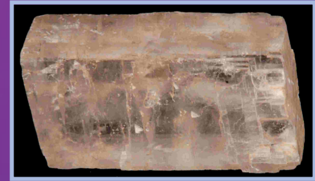
Calcite or Iceland Spar

The different faces of a crystal have different rates of growth. These rates depend on the structure of the crystal, and also the conditions of growth, such as temperature, pressure and impurities in the composition of the mother liquid. The forms generated may or may not be randomly associated. All of which results in an extraordinary diversity.