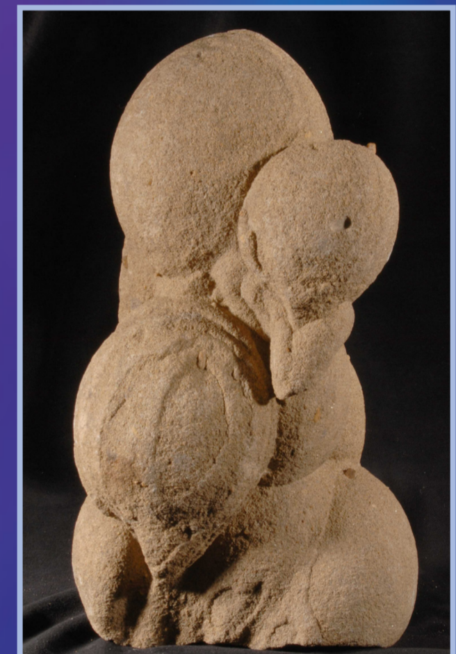
Siliceous calcite sculpture in «gogottes», Saint Marcellin, Isère, France