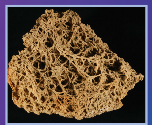
Concretion of calcite, Baia Mare, Roumanie