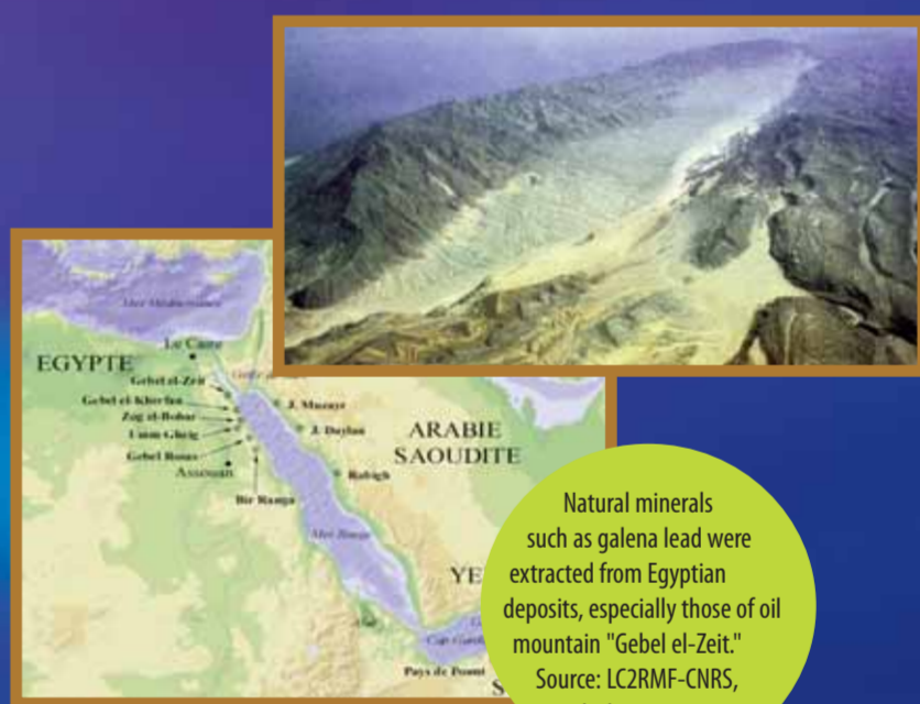
Natural minerals such as galena lead were extracted from Egyptian deposits, especially those of oil mountain "Gebel el-Zeit." Source : LC2RMF-CNRS, Le Louvre

Ancient texts ( Dioscoride, Pline ) describe a method for synthesis of these precipitates PbOHCl laurionite and phosgenite Pb 2 Cl 2 CO 3 , with therapeutic properties. The long (3 month) process was perhaps the first experiment in soft chemistry to make a medicine. Source : LC2RMF-CNRS, Le Louvre