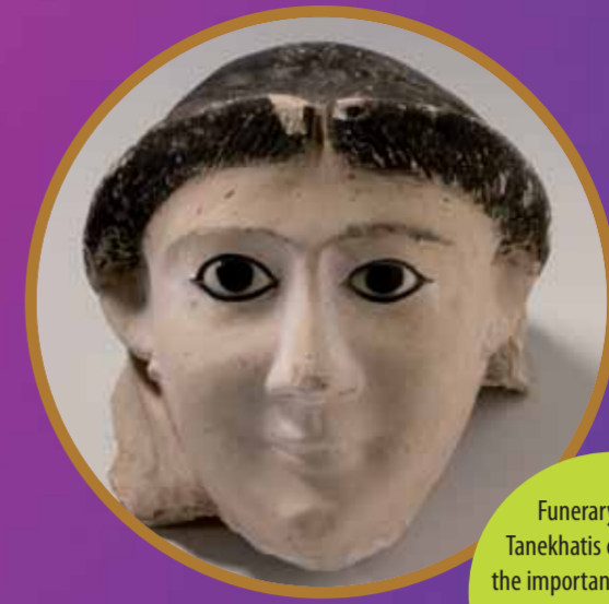
Funerary mask of Tanekhatis emphasizing the importance of makeup

Objects found in ancient burial sites are often made up of crystallized chemical materials. These crystals are, for those who know how to "read them", real archives.