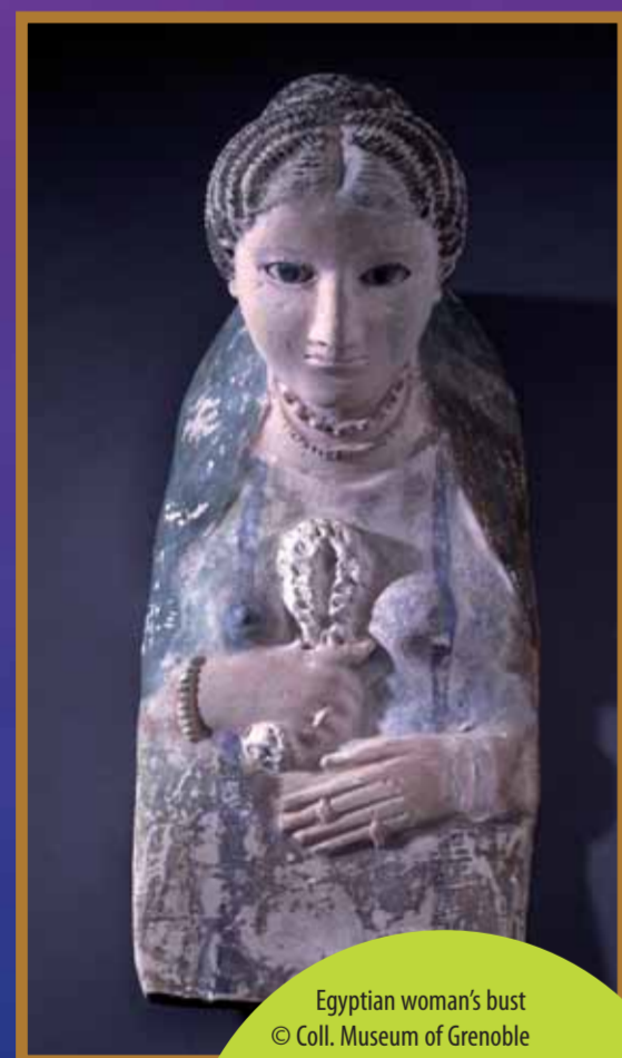
Egyptian woman's bust

In the tombs of Egypt from third to fifth centuries BC, grave goods, everyday items and toiletries were found. The materials and their crystals are examined by researchers using beams of light, X rays, neutrons and electrons. These studies, together with the evidence and interpretations of the archaeologist, lead to an understanding of their development and purposes.