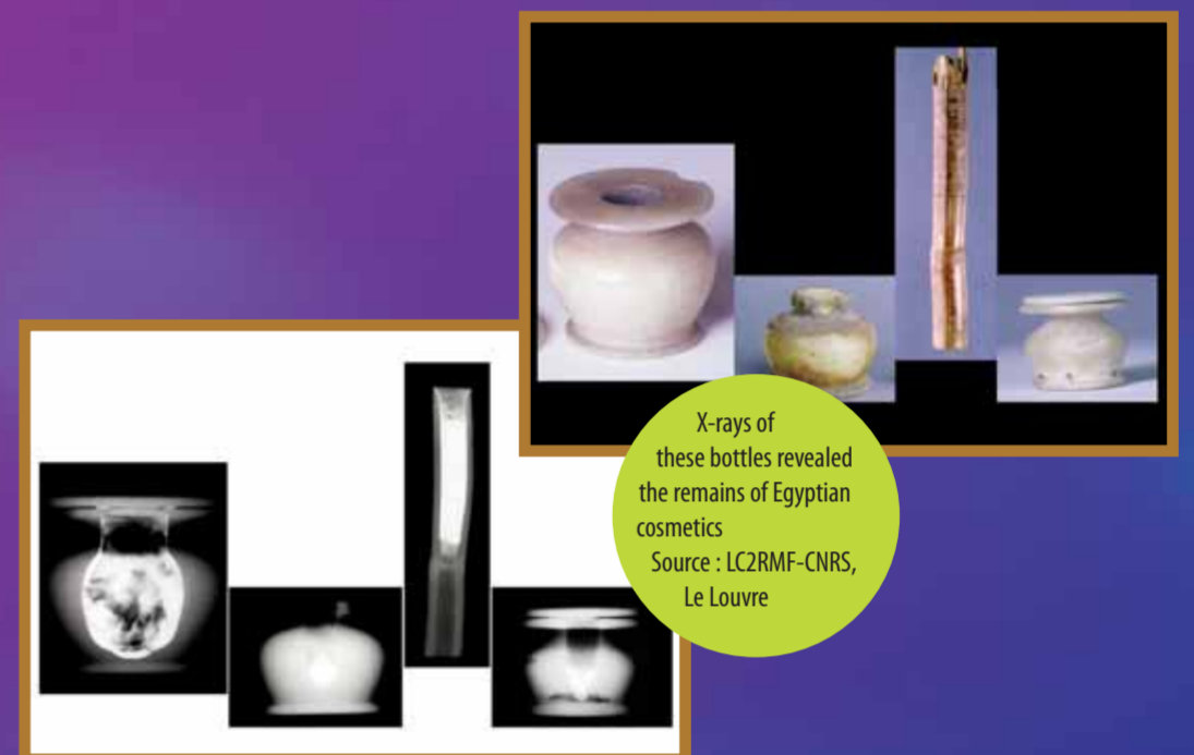
X-rays of these bottles revealed the remains of Egyptian cosmetics