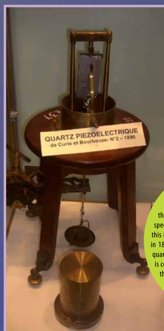
The Curies' quartz balance

The discovery of piezoelectricity led the Curie brothers to build a generator of specific quantities of electrostatic charges: this is the Curie electrometer built by Bourbouze in 1890. The unit is built around a thin plate of quartz cut in a special way. Each side of the plate is covered with a sheet of metal which collects the electric charge generated by traction on the plate.